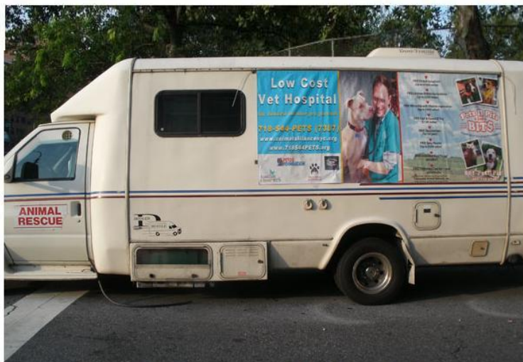
The mobile low-cost vet program handles thousands of cases a year.

extensive hours in which volunteers can offer immediate help and advice to people who are often frustrated with their animal issues.