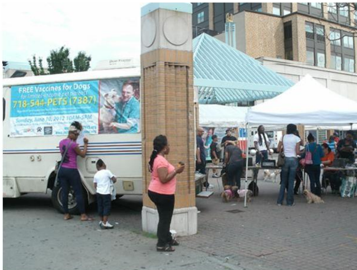
A day fair offering free vaccinations drew a crowd.

This is the salient point for animal shelters everywhere -- and for the animal welfare community -- to consider: Fewer animals entering the shelter system mean fewer animals euthanized. Shelter authorities and advocates have paid so much attention to adoptions, fostering, rescue -- and the spay/neuter message has been extensively promoted -- but that is only part of the solution to the problem.